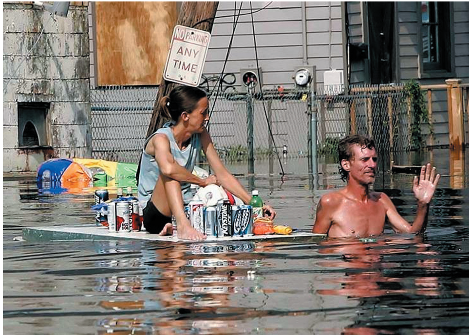
The Faces of Displaced Addiction: a New Orleans resident accompanies a woman floating on a piece of plywood laden with Bud Light, Budweiser, Keystone Ice, Red Dog and Natural Ice beer, along with two bottles of hard liquor, 7Up, mustard and toilet paper.

in these events is a significant one. Some data exists from the Oklahoma bombing, the war in Iraq and 9-11 that when a strained addiction treatment system is further burdened a storm, terrorist attack, or, in the future, perhaps a medical contagion, that many substance abuse dangers exist. Nevertheless, substance abuse trends are likely to be complex and elusive, particularly when problems remain below threshold for significant periods. More naturalistic research will be required, examining not only overall trends in substance use but also how they interact with numerous pressures, including poverty and trauma. Through research and dissemination, the average